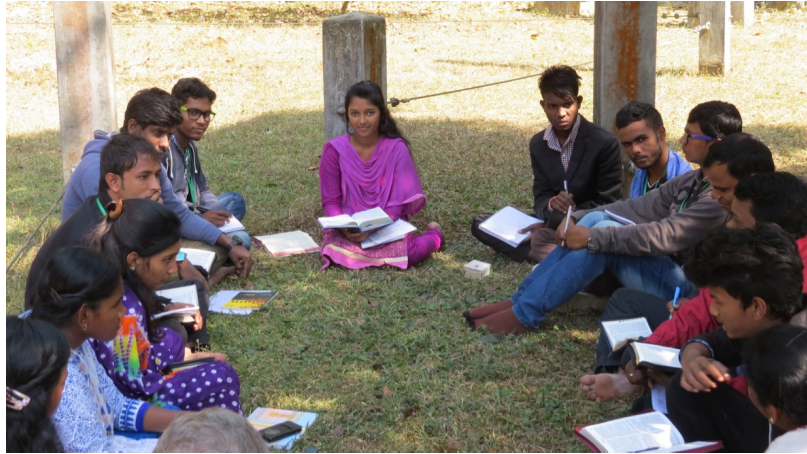
(Pictured: students leading their peers in devotions in Bangladesh)